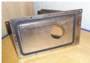
From the back

The mounting panel is an accessory to the DA7300 On-Line NIR analyser. This facilitates mounting on a vessel, a conveyor side or any other location where the instrument is viewing the product from the side. The panel mounts on a frame that is to be welded on to the side of the measurement chamber in question.