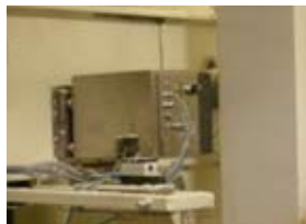
With instrument mounted