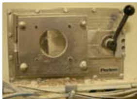
Mounted on conveyor