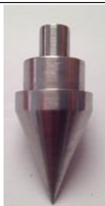
Figure 2: P-CO45S

P-CO45S, Conical Probe, 45°, Stainless Steel (Figure 2) Part number: 67.15.45